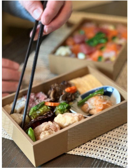
Kenzo Estate Tour & Tasting Bento Box Experience