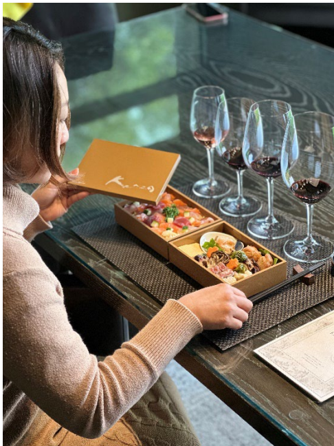
The authentic lacquer box has two levels, containing Michelin Star Kenzo Napa prepared Japanese delicacies.